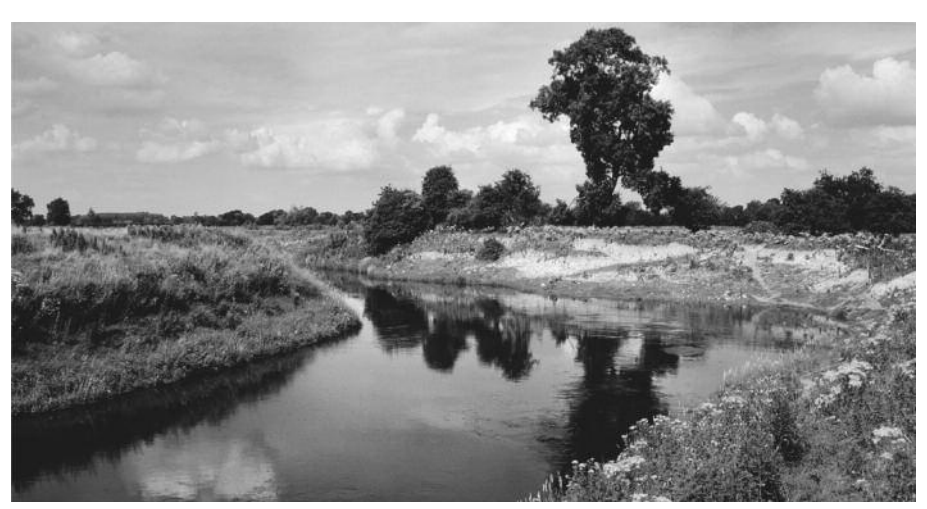
The river Dee at Holt-Worthenbury – natural river bank within designated conservation site.

important habitats, emphasising the structure and role of their plant, animal, and microbial communities. Upon this are built chapters that review the pioneering role of Welsh river studies in the development of running water science and, very poignantly, assess the high degree of human alteration of the principality's riverine ecosystems. These are followed by chapters that discuss the need for further scientific study, management, conservation, restoration and education so that future impacts on Welsh waters may be understood and minimised. Throughout the book flows the underlying theme that there has been and always will be a close link between water resources and the development of Welsh society. The book is data-rich, very well illustrated, and contains a bibliography of over 1.100 references to the scientific literature.